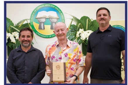
Excellence in Assessment Anthropology & Philosophy Programs