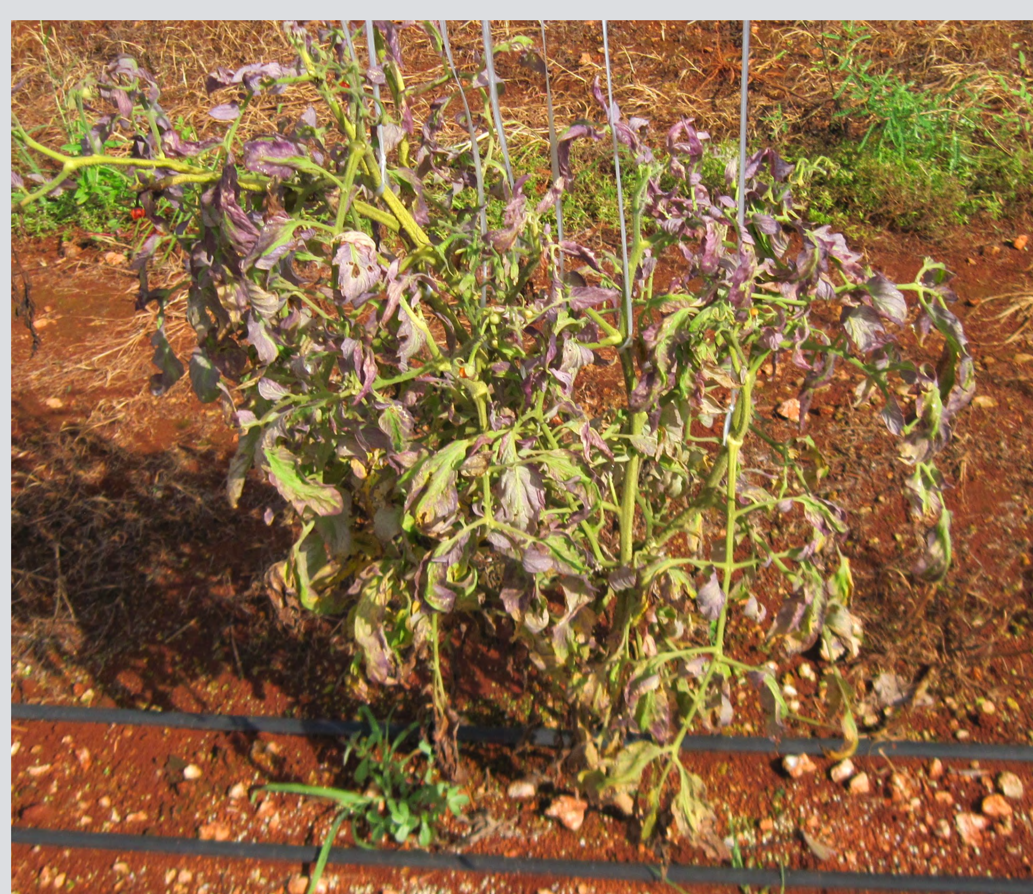
Figure 3: Tomato plant with severe AYVV symptoms, identified as scale 5.