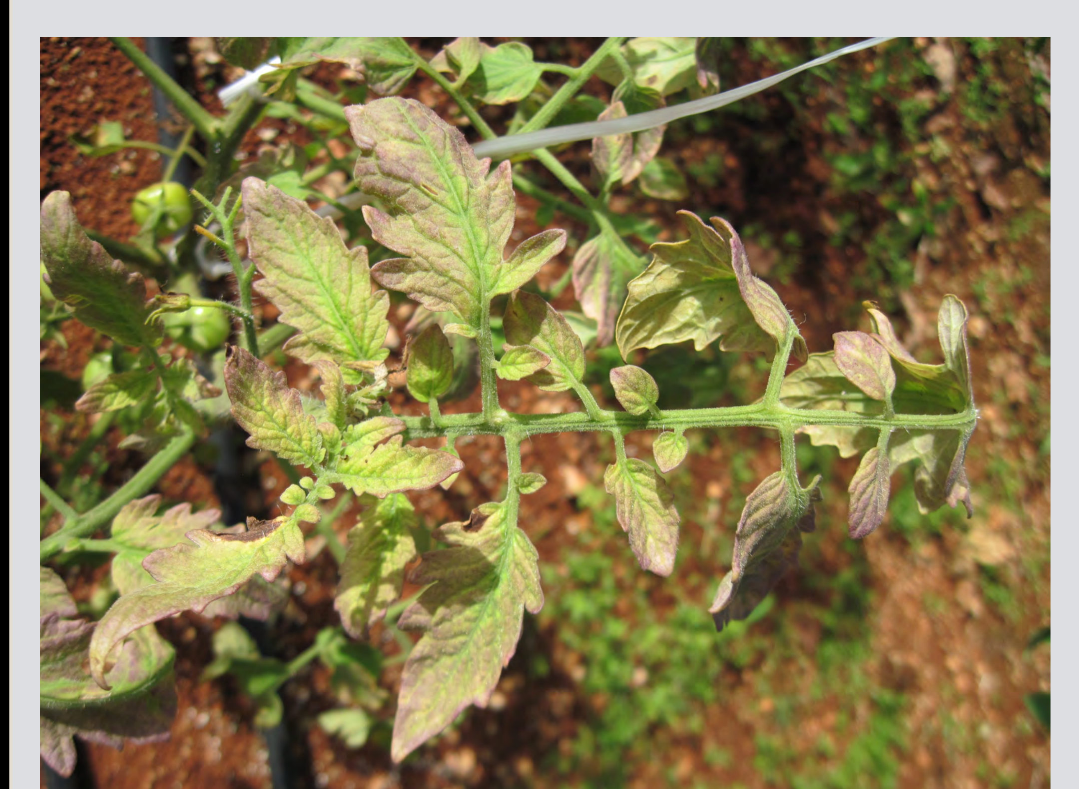
Figure 4: A close-up of a tomato leaf with AYVV symptoms, identified as scale