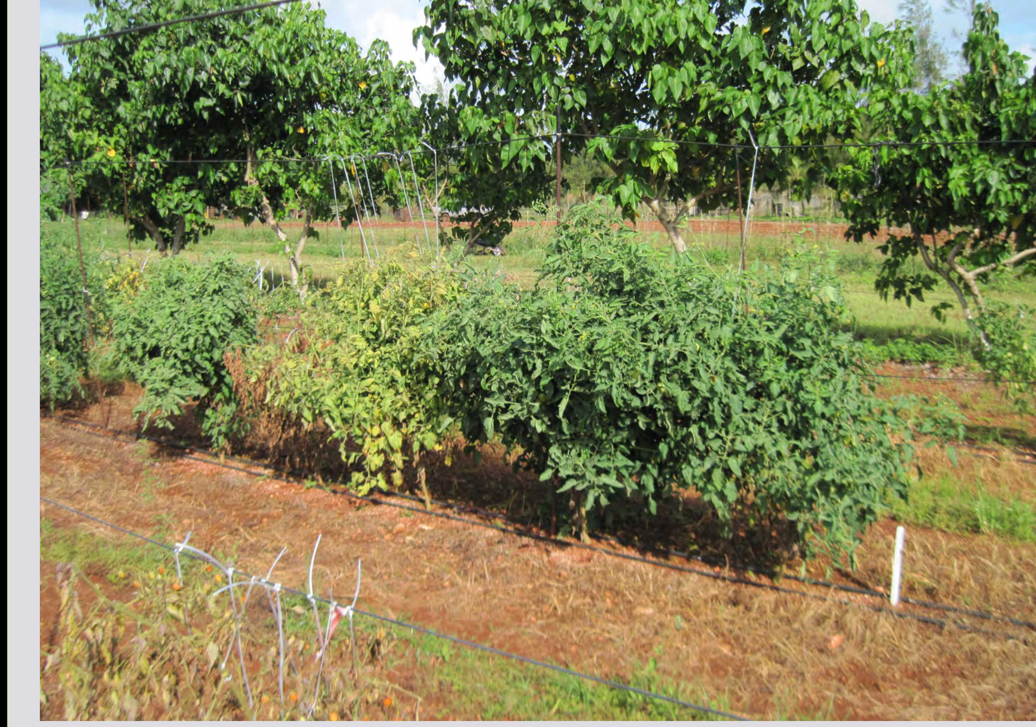
Figure 2: An AYVV infected tomato plant (scale 4), compared to a healthy

Tomato varieties were compared against the control and analyzed using a cumulative logit model. Virus severity was a natural ordinal response variable. Variety ID vs. Control was an explanatory where each variety was compared against the control variety. Plot ID was added into the model as a blocking factor to improve the model's