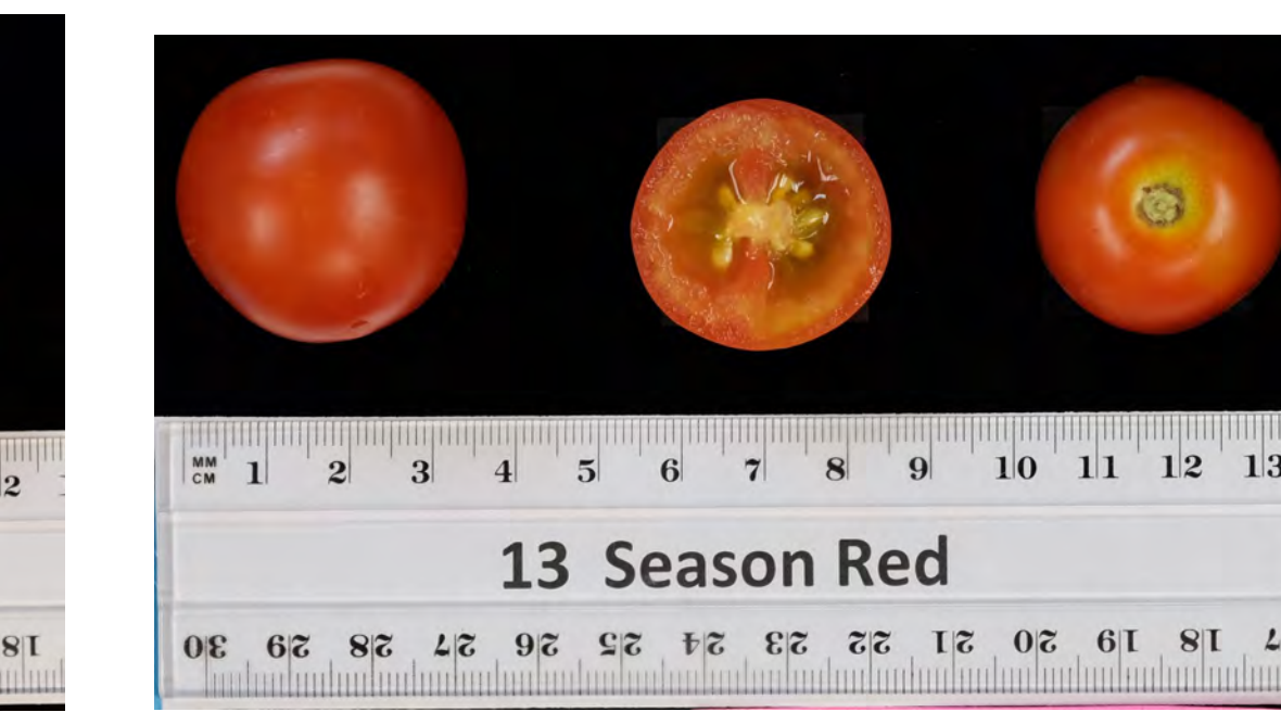
Figure 5: Varieties selected by producers for suitability on Guam during wet-season, compared to 'Season Red'.

In a separate replicated trial planted on October 2014, plants again exhibited AYVV symptoms; however, Real-time PCR analysis showed low frequencies of the virus This may indicate the presence of another virus affecting tomato produc-