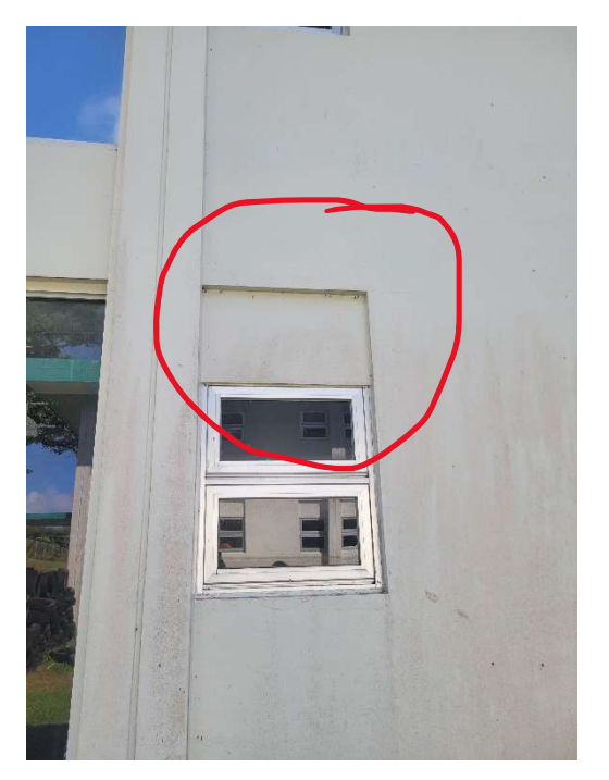
Guma' Ta Hallway windows

For all 3 buildings second floor windows the top portion is either aluminum louvers or covered with plywood. Please confirm the shutter need to cover the top portion. If we do the shutters only on the glass area the shutter needs to be mounted on the plywood. This may affect the wind load.