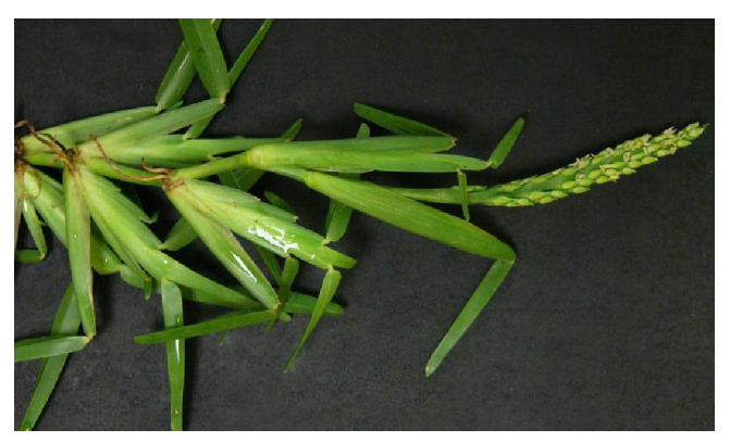
Figure 2. St. Augustine grass.

Proper soil preparation is essential for successful establishment of a lawn. Grasses and other weeds that are hard to control should be treated with herbicide such as Roundup (glyphosate) before planting. Especially on larger areas, cultivation by plowing or rototilling to six inches would be helpful to establishing and maintaining a healthy turf. After leveling the area and collecting rocks bigger than golf balls, soil test can be performed to determine fertilizer recommendation. If you wish to use a general rule of thumb (without testing soil), mix 4-5 lbs of 15-15-15 fertilizer per 1000 sq. ft. into the top 4-6 inches while raking or harrowing the area to smooth the surface before planting.