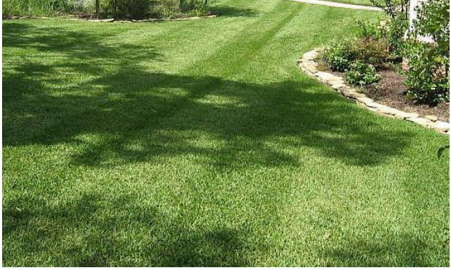
Figure 1. A lawn with St. Augustine grass.

St. Augustine grass ( Stenotaphrum secundatum ) is a turf-grass widely adapted to the warm, humid regions of the world such as Guam. Its large and fast-spreading stolons are easy to cut around flower beds and shrubs, either by hand or with a piece of turf equipment called an edger. This characteristic makes St. Augustine grass a desirable choice for many home-owners and landscapers. It can be successfully grown in a wide variety of soils and under proper maintenance and a mowing height of 2-3 inches, it produces a dark-green, dense turf with exceptional shade tolerance. The shade tolerance of St. Augustine grass is superior to that of all other tropical turf-grasses. On the other hand, St. Augustine grass has poor tolerance for heavy traffic and is quite often infested by insects, mostly by leaf chewing caterpillars. Weed control in St. Augustine grass is somewhat challenging and few herbicides effectively control weeds without injuring the turf. For that reason, the best weed control is frequent mowing. St. Augustine grass needs watering, especially during the dry season. Planting material on Guam is still not commercially available. Lawns are often planted by obtaining plugs from friends and neighbors.