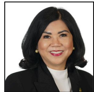
Håfa Adai, Triton Community!

Welcome to the April edition of The President's Report. This newsletter will keep you updated on the latest news, achievements, and milestones at the University of Guam.