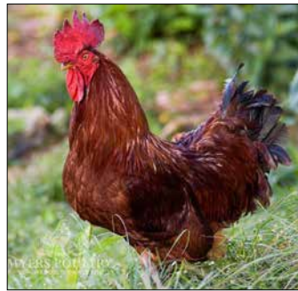
Rhode Island Red