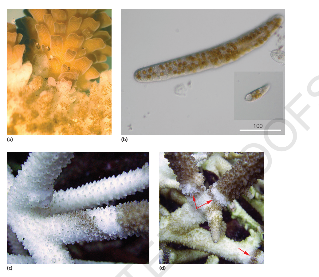
Fig. 23.1 (a) brown band infection on Acropora surculosa , showing dense ciliate band adjacent to healthy, intact tissue (photograph: L. Raymundo); (b) a scuticociliate from Guam taken from a brown band infection on Acropora muricata , showing recently consumed zooxanthellae from the coral host (photograph: C. Lobban); (c) brown band infection on Acropora intermedia from the central Philippines, showing a distinct white zone between healthy tissue and the ciliate band (photograph: L. Raymundo); (d) multiple brown band infections within a single colony of A. intermedia (photo: L. Raymundo).

confirmed microscopically and ciliates were observed to actively feed along the exposed tissue margin from the fragment base upward, consuming tissue at an average rate of 1.85 mm/h(Lobban et al. 2011). Within five days, 88% of the fragments (n = 30) were completely devoid of tissue. Willis reported similarly high tissue loss rates in situ on the GBR (>5 cm/day) starting from the branch base and progressing upward (Willis, personal communication). Haapkylä et al. (2009) reported in situ progression rates averaging 1.2 cm/day, representing the highest rates of tissue loss among four diseases monitored in Indonesia.