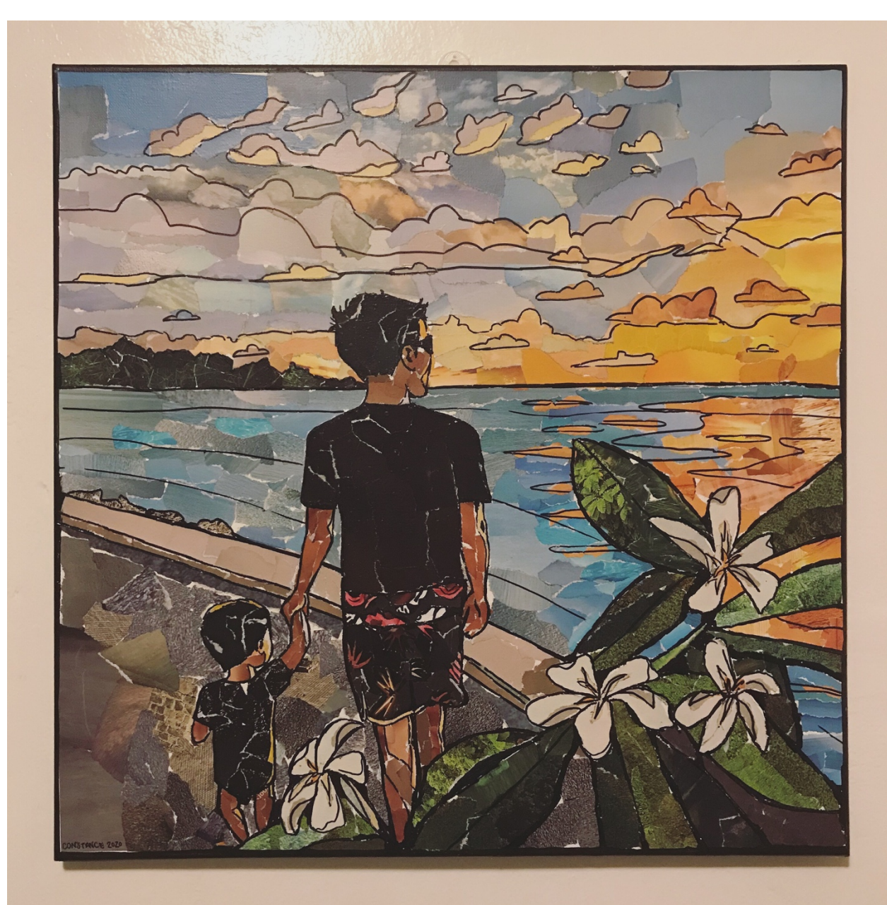
2020-family-sunset-sartor "Family Sunset," a collage by Constance Sartor