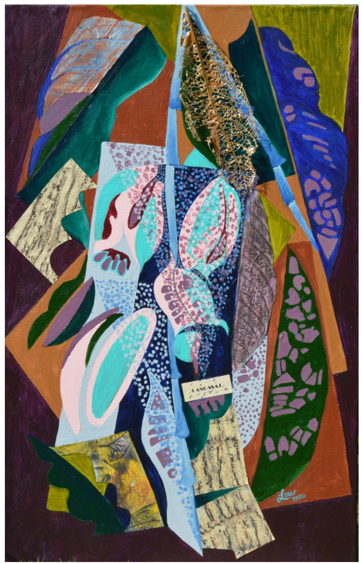
2020-langasat-reyes "Langasat," an acrylic painting on canvas by Dawn Lees Reyes