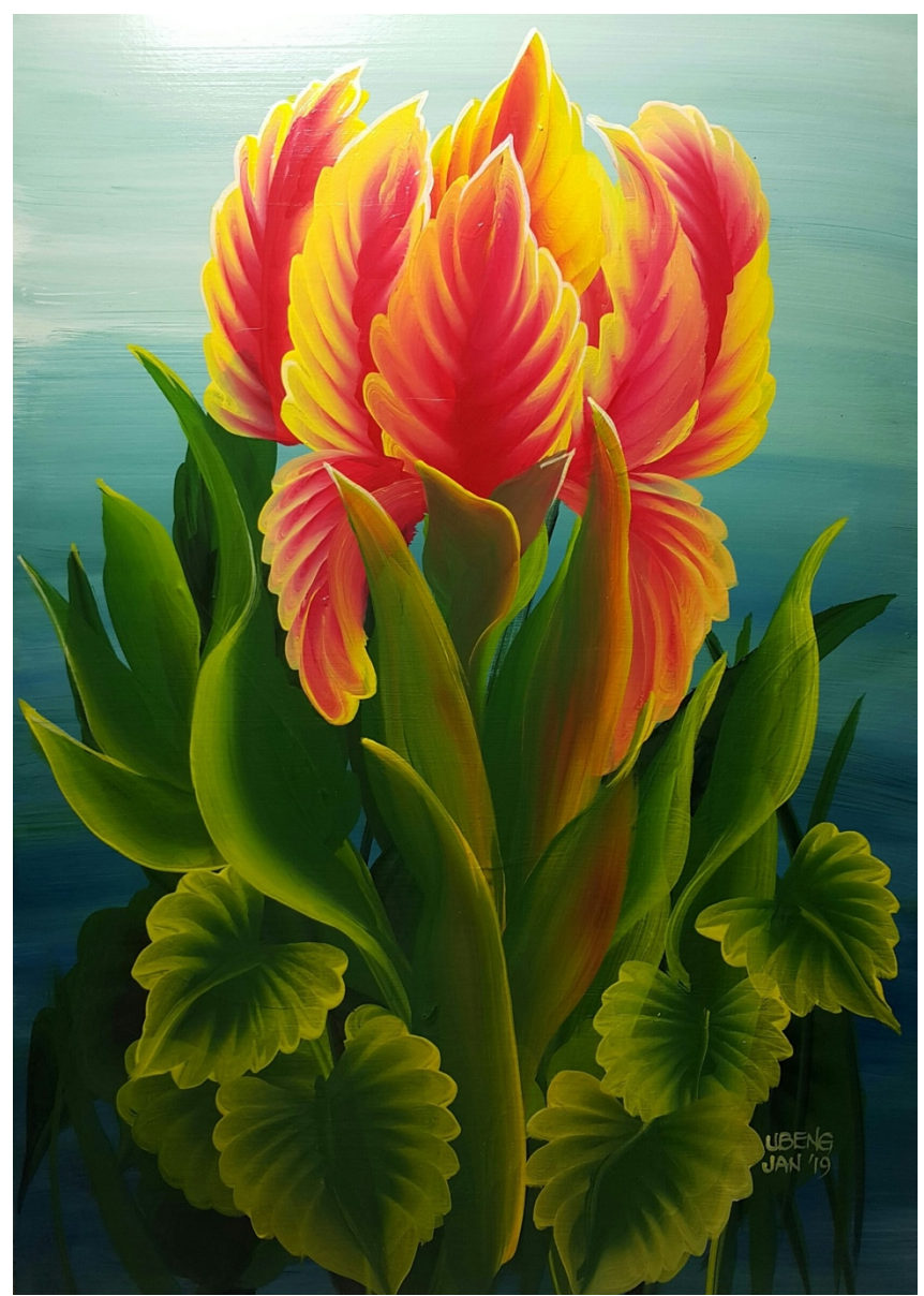
2020-flower-fabro-torres "Flower," an acrylic painting on wood by Ubeng C. Fabro-Torres