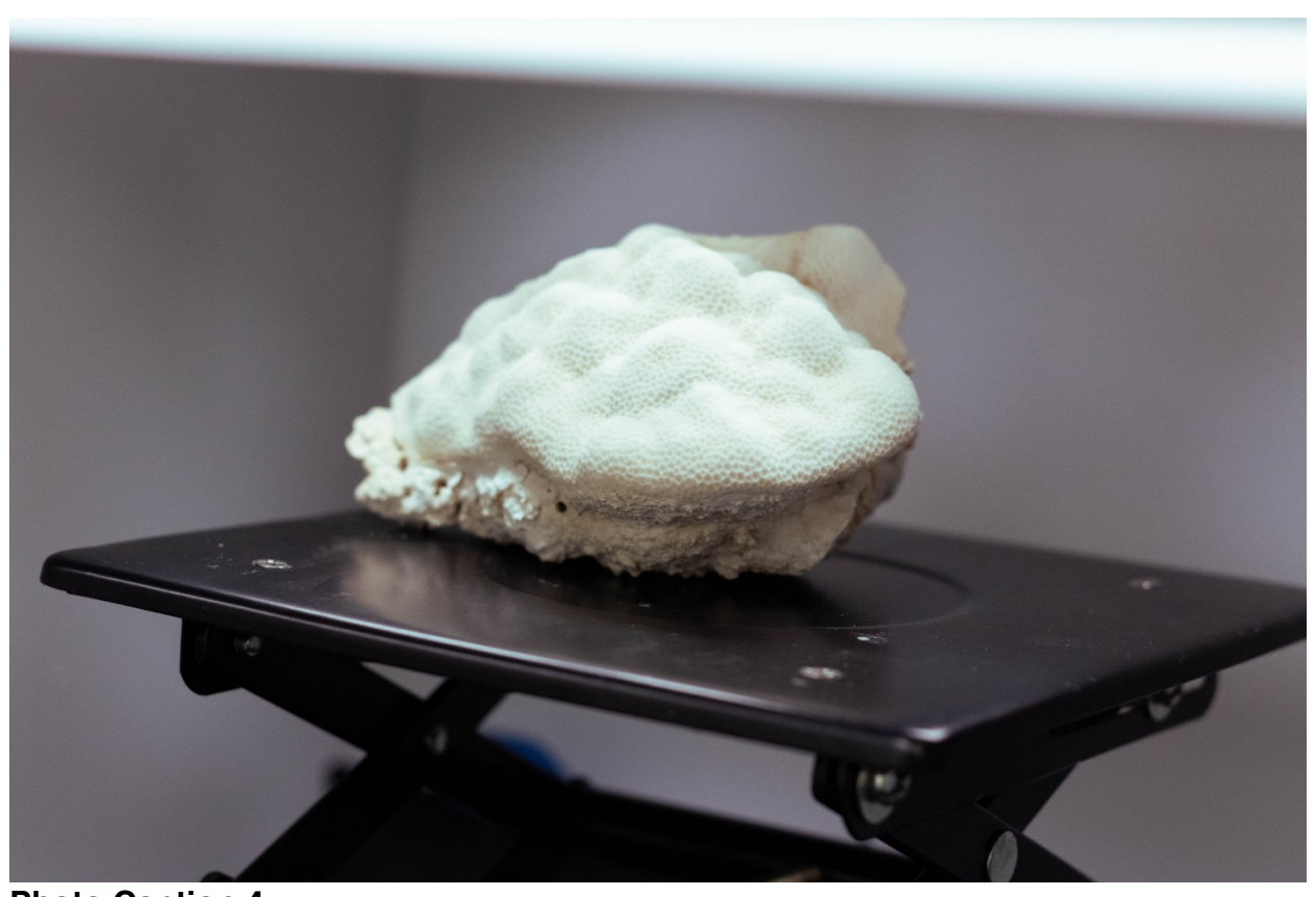
Photo Caption 4: A coral specimen is photographed in the GECCO Biorepository at the University of Guam Marine Laboratory. Its photo and data will be uploaded to the facility's website.