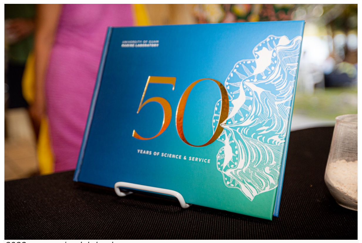
2022-uog-marine-lab-book "University of Guam Marine Laboratory: 50 Years of Science & Service" book cover