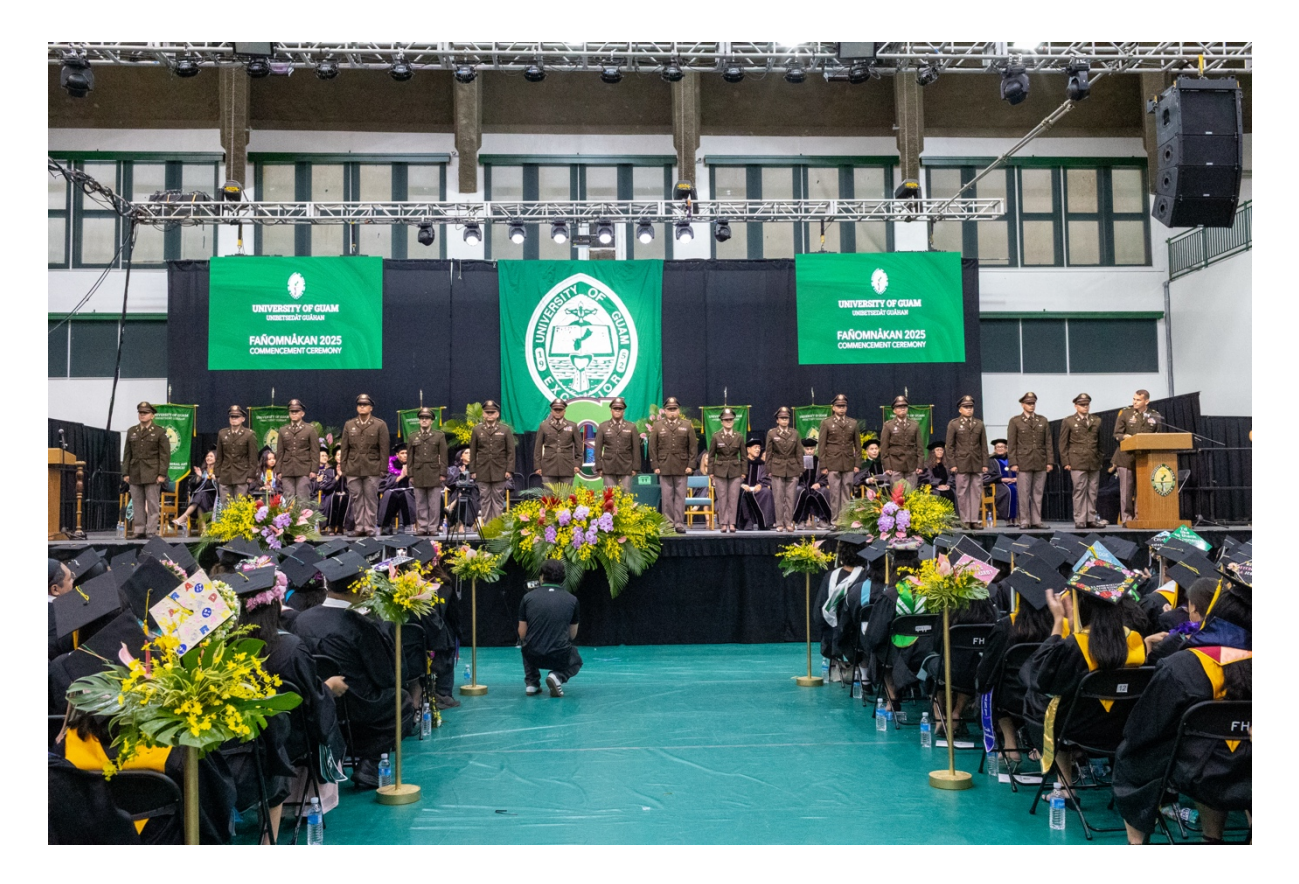
25SP-UOG-students-group-rotc.jpg - Among the graduates at the University of Guam's Fañomnåkan (Spring) 2025 Commencement Ceremony at the Calvo Field House on May 25, were 16 newly commissioned U.S. Army officers from UOG's Army ROTC program. Since 1982, the program has commissioned 609 UOG graduates as officers in the U.S. Army.