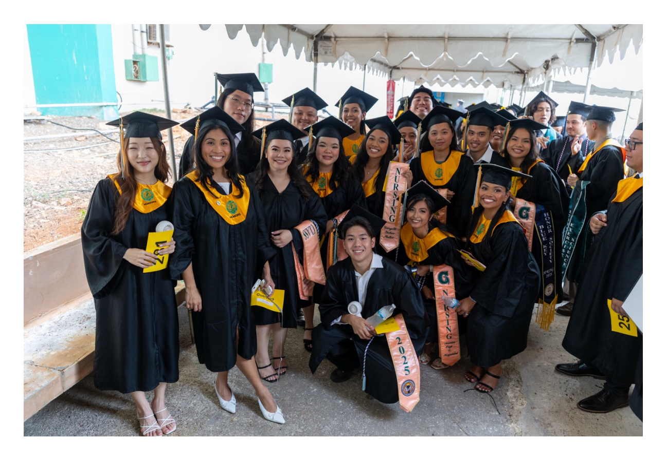
25SP-UOG-students-group-nursing.jpg - Nursing graduates gather for a photo before the University of Guam Fañomnåkan (Spring) 2025 Commencement Ceremony at the Calvo Field House on May 25.