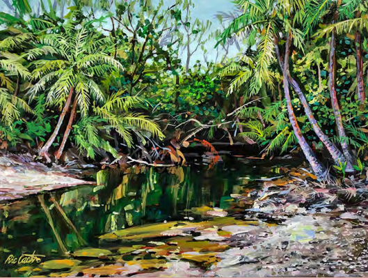
"Cetti River Outlet," an acrylic painting by Ric Castro