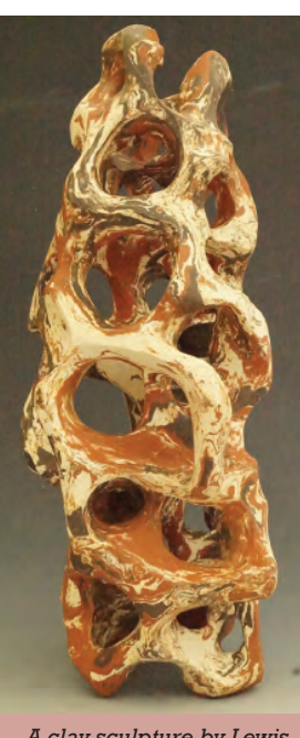
A clay sculpture by Lewis Rifkowitz