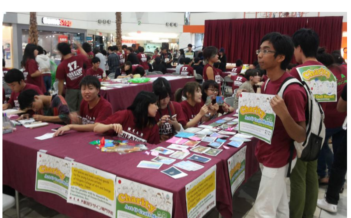
Visiting students from Niigata College of Art raised $1,126.00 selling their art works at the Micronesian Mall, and donated the money to the UOG Fine Arts program.