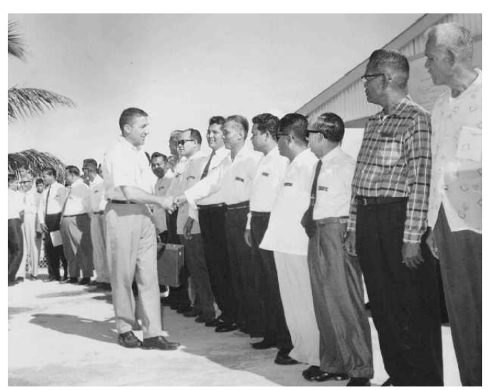
Secretary Udall visits Trust Territory headquarters in Saipan, 1962.

In February 1963, the task force recommended an increase in Peace Corps volunteers. That decision helped the educational system in the FSM by training teachers and has continued to the present. On May 9, 1963, Anthony V. Solomon headed an important mission to research the Trust Territory and make recommendations. One surprising discovery was that U.S. officials wanted to preserve local traditions and not teach English, but the islanders were wanted to learn English and embrace modern views. Solomon recommended a 1967 or 1968 Micronesian vote between independence and permanent affiliation with the U.S. (as cited in Willens and Siemer, 2000, pp. 42–43).