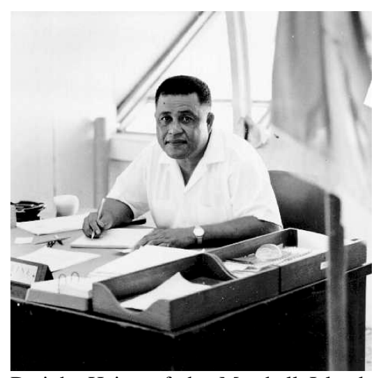
Dwight Heine of the Marshall Islands chaired the Council of Micronesia and helped form the Congress of Micronesia.

Continental Congress worked out the differences between "the merchants of Boston and the planters of Virginia."