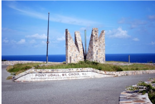
Left: Point Udall, Guam; right: Point Udall, St. Croix, Virgin Islands.

Ultimately, administering Micronesia involved returning those islands to the original status of self-rule by the indigenous people. This transition involved many U.S. presidential administrations with various agendas for Micronesia. In the late 1940s the U.S. military began with controversial nuclear testing but also slowly rebuilt the islanders' educational infrastructure. The 1950s witnessed the educational efforts of Elbert Thomas and others. During the 1960s, John Carver and Stewart Udall engaged with indigenous leaders in decades-long debate about self-government. Micronesians united to push for self-government, and Mo Udall's efforts cemented today's Compact of Free Association. That same debate dramatically pushed forward