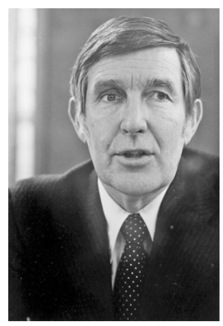
Representative Mo Udall, chair of the House Interior and Insular Affairs Committee with oversight for the Pacific.

The debate over Micronesia's status divided into two major factions. The northern factions in Micronesia wanted a political future apart from the less-developed islands (what later became the Federated States of Micronesia). In April 1972, the Northern Marianas Islands began negotiating to become a commonwealth. These negotiations culminated in President Gerald Ford's signing the Covenant Establishing Commonwealth Status for the Northern Mariana Islands on March 24, 1976.