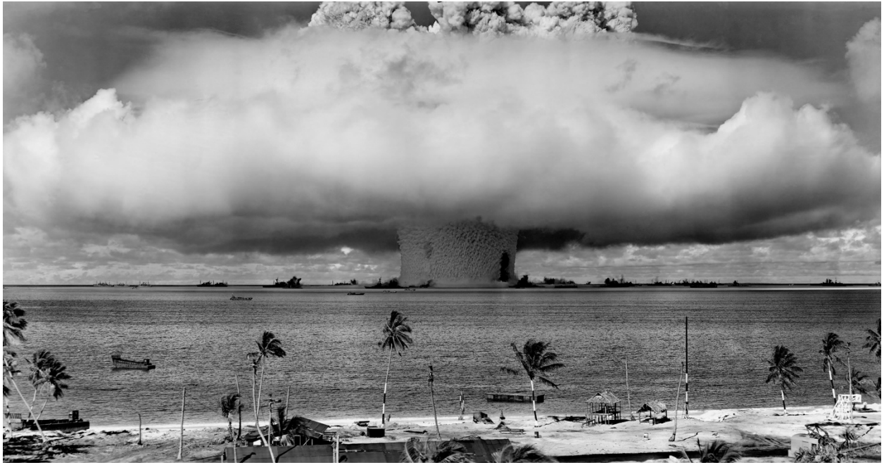
The "Baker" explosion, part of Operation Crossroads, a nuclear weapon test by the U.S. military at Bikini Atoll on July 25, 1946. Photo in public domain.

Meanwhile, the U.S. military machine was churning out and testing weapons of mass destruction, and nuclear testing began in 1946 on Bikini and Eniwetok atolls in the Marshall Islands. Until 1958 some 67 tests were conducted, causing severe health risks for the people of the Marshall Islands (Skoog, 2003, p. 69) and initiating Cold War tensions with the Soviet Union.