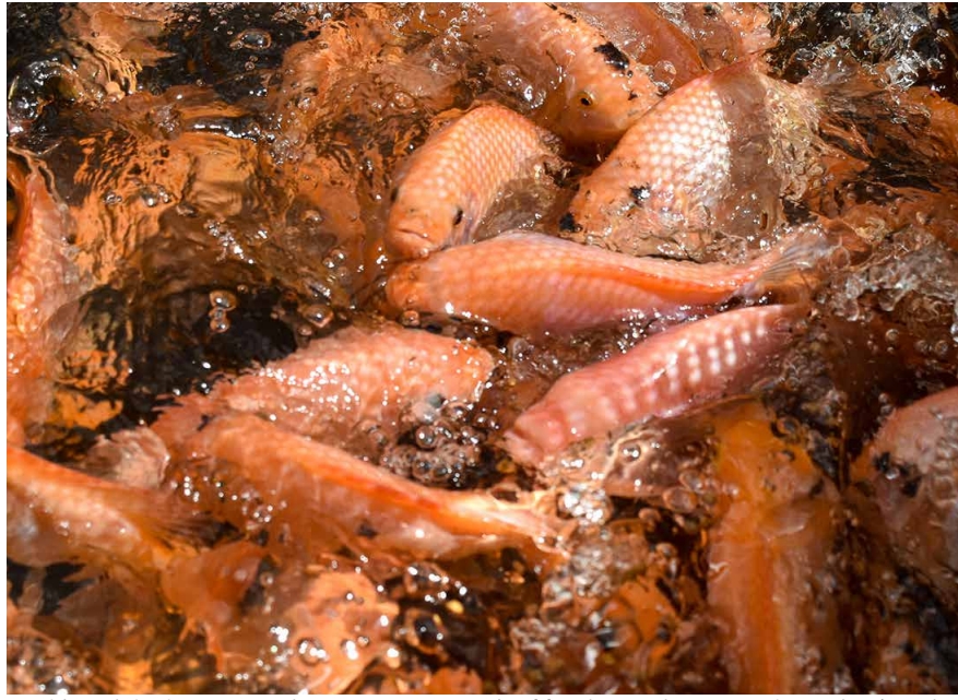
Healthy adult tilapia peer above water in search of food at Andrew Manglona's backyard tilapia farm.