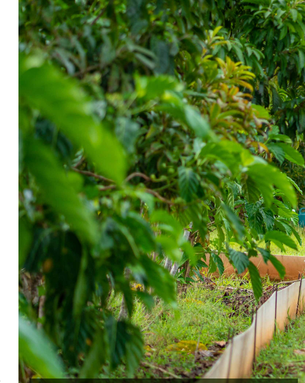
UNIVERSITY OF GUAM WESTERN PACIFIC TROPICAL RESEARCH CENTER