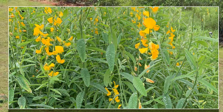
Sunn hemp, with its fibrous stalks, produces a significant amount of nitrogen when it is cut and incorporated into the soil.

An aerial photo of sunn hemp growing at the Yigo Research & Education Center as a rotational crop to add nutrients to the soil before corn is planted.