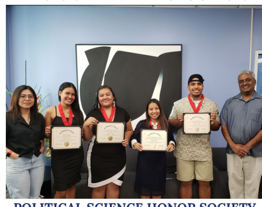
POLITICAL SCIENCE HONOR SOCIETY