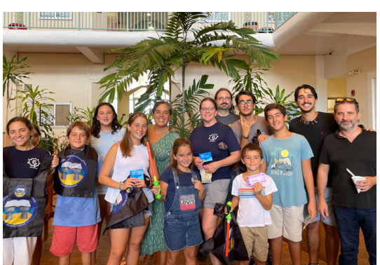
WELCOME BACK TRITONS