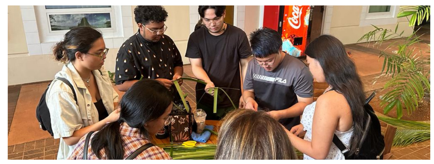
During the Fanuchånan 2023 semester, the CHamoru Studies Program hosted workshops, visited neighboring islands, and so much more. Here are some program highlights capturing students learning the CHamoru culture and practices. See highlight photos on page 12.