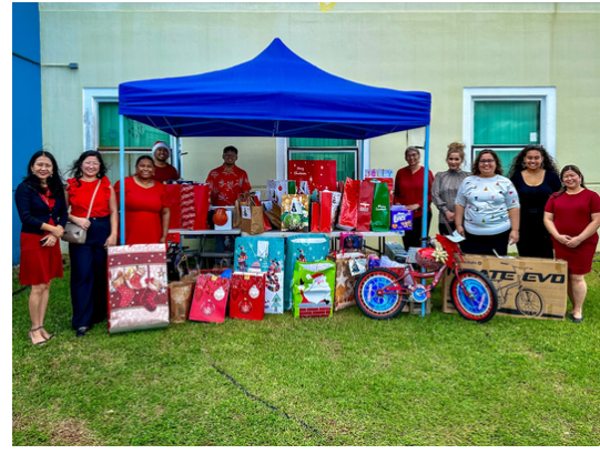
DONATIONS TO ALEE SHELTER